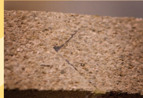
Glued joint detail